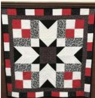
Workshop by Anelie Belden on April 12th.